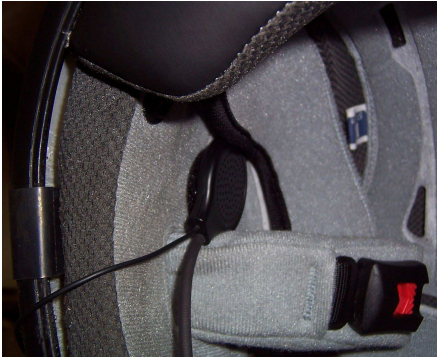
the speaker with short wire cord for left ear