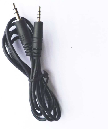
2.5-3.5mm audio adapter cable

NOTE2: you only can adjust the music volume on your MP3.