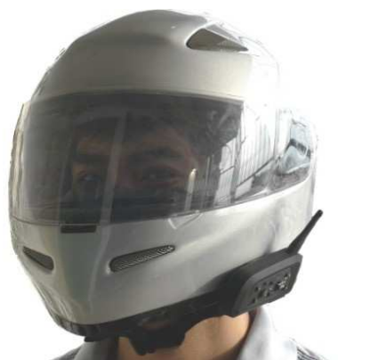
R4 mounted on a helmet