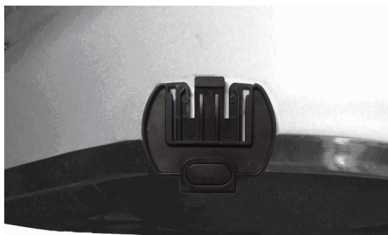
Clip fixed on a helmet

Insert the plate between the shell and the foam of a helmet, fix with screws