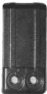
Inserted plate for clip