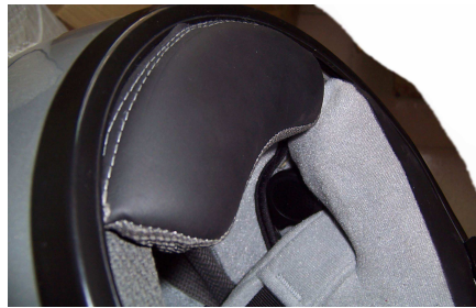
the speaker with long wire cord for right ear